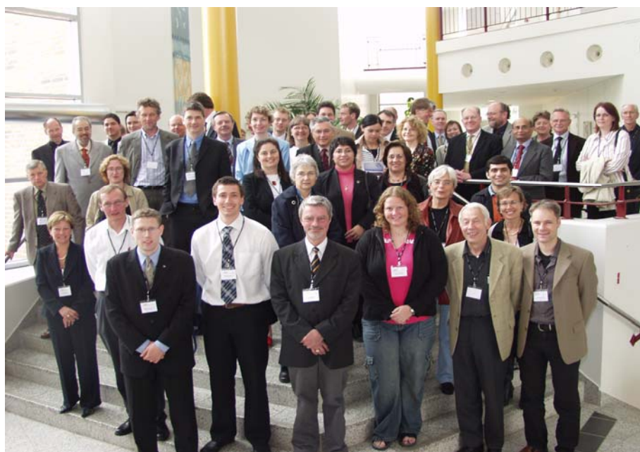
Participants at the ECIU General Meeting

The next edition will be published in late September 2005. The deadline for submitting articles will be 10 September 2005.