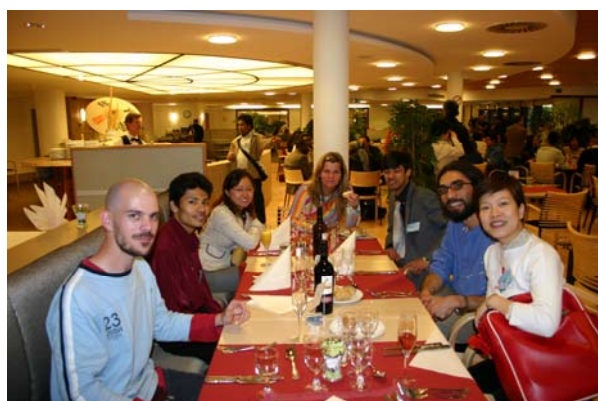
Seminar Participants from EMMS