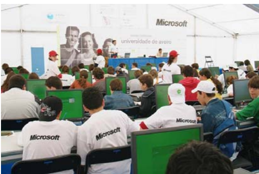
Portuguese pupils at the EQUAamat 2005.

I challenge you to visit the website http://pmate.ua.pt . Can you finish in less time than they did? I can't!