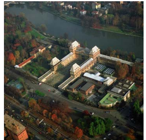
A UNESCO World Heritage Site on the campus of the Politecnico di Torino.

The highest degree of integration between Politecnico di Torino and some of the most excellent partner universities has been reached with the implementation of double and joint degree agreements. The scheme of these projects allows students from both universities to spend a study period abroad (typically the last 3 semesters of the curriculum) at the partner institution, experience a different academic system, be integrated in the most appropriate curriculum, get proficiency in a new language and attain two equivalent degrees from the two partner institutions (each of them recognises the workload completed by the student in the foreign University). Currently, around 40 double degree agreements have been signed taking advantage of the mutual recognition of the exchange students work in the frame of the Socrates/Erasmus programme. In the last years, a special attention has been given to new geographical areas like Latin America, Eastern Europe and Middle-East and several double or joint degree agreements have been signed or will be signed in the next future with Universities operating in those areas.