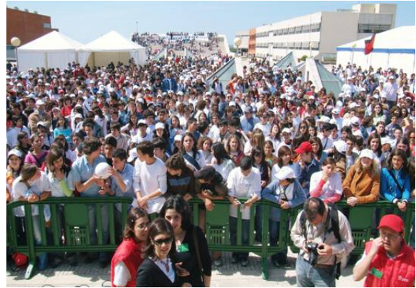
Thousands of school pupils attending the Math Festival at the University of Aveiro.